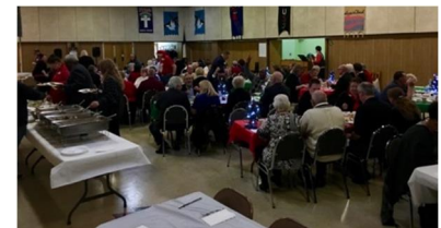
Crossroads District Christmas Party

December began with Asbury hosting the Crossroads District Annual Christmas party. Over 115 people from churches in Flint and around mid-Michigan were hosted for a great dinner catered by Masonic Temple and worship. The Christmas skit gave us all a few good laughs and a lot to think about. Christmas seems to presume hospitality. It is a reminder that the God we serve is both our Lord and our host who taught us that hospitality is a divine gift and mandate.